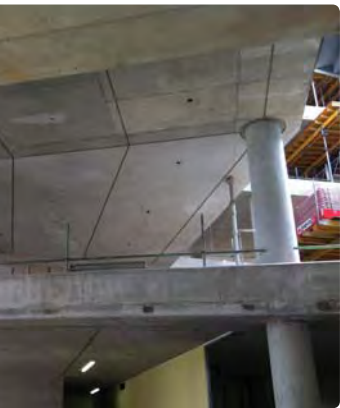
Feature soffit recess details and site co-ordination.

The majority of the concrete throughout the scheme is exposed special class (BS 8110 6.2 7.2) with a Keim Concretal Lasur paint finish to homogenise the colour of the various elements of the exposed frame. This decision was made early on as both an aesthetic choice and also a cost saving against a suspended ceiling system. Retaining a high-quality finish on the soffits and negating the need for any surface-mounted conduit required a co-ordinated approach to the servicing strategy from all team members. The overall strategy was to run all conduits and ductwork within a 600mm raised-access floor and drop through the slabs. This needed every penetration to be designed and co-ordinated prior to casting the slabs, to reduce unnecessary time on-site.