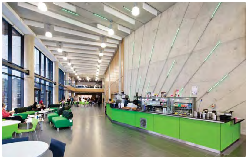
Meeting Place Café space.

Concrete was used extensively for the main primary structure, cores and as a key interior-design aesthetic. This maximised the use of the building's thermal mass to assist in stabilising daytime temperature swings and limiting the need for additional specific cooling.